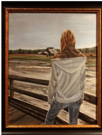
2nd Pat Lontor "On a Clear Day You Can See Forever" oil