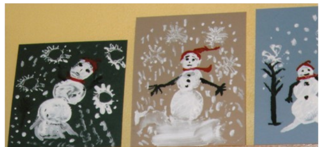
Samples of student work