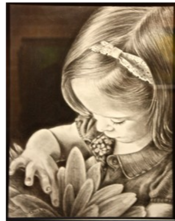
3rd Debie Plog "Lauren" pencil