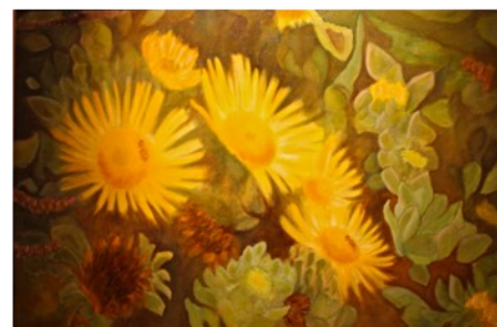
4th place - Renee Hirsch "Sunny California" oil